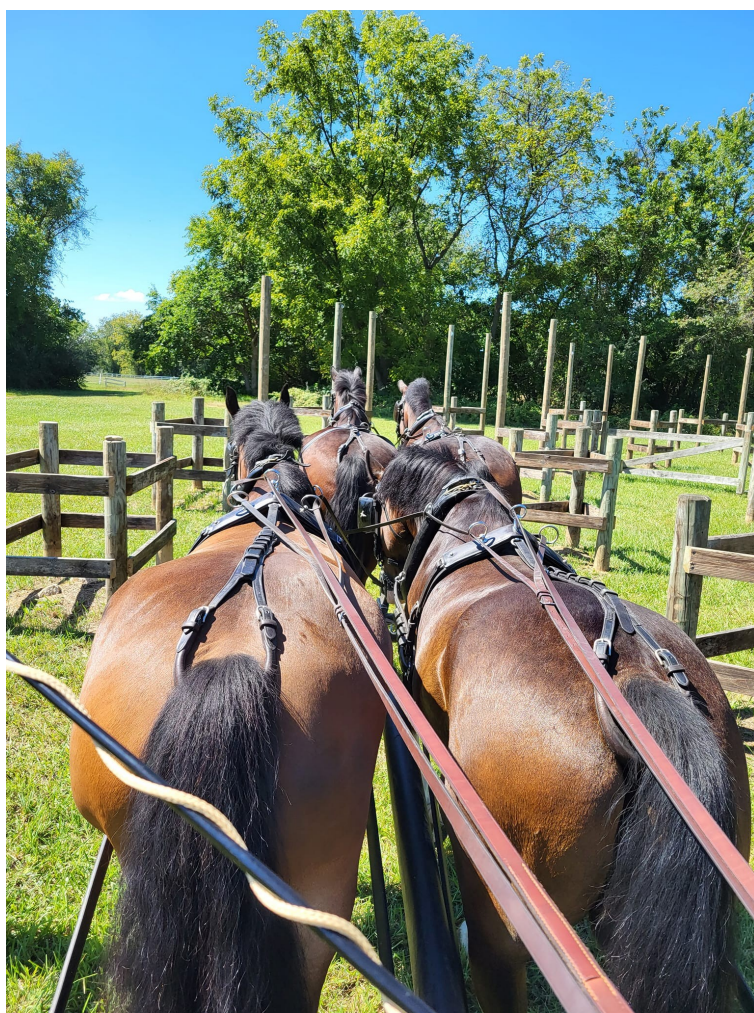
Frances Baker driving an obstacle at Fair Hill