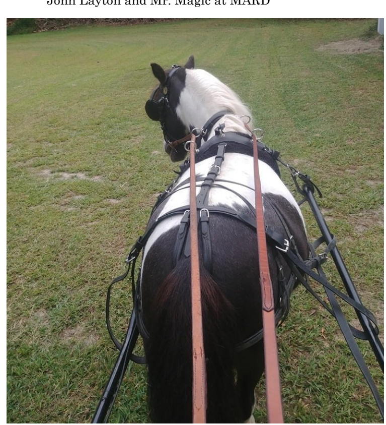
Maddy and Oreo are back driving!