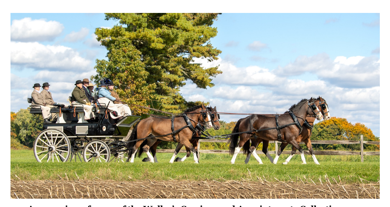
An overview of some of the Waller's Carriage and Appointments Collection