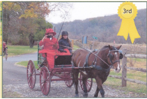
Pleasure Shows & Drives - Submitted by: Mary Nelson - Photographer: Ed Nelson -Title: Who's Photographing Who?