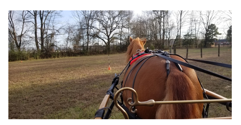
Shannon Gandee driving Beau