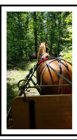
June 22, 2019 Club Drive at Blackbird Forest near Smyrna , DE