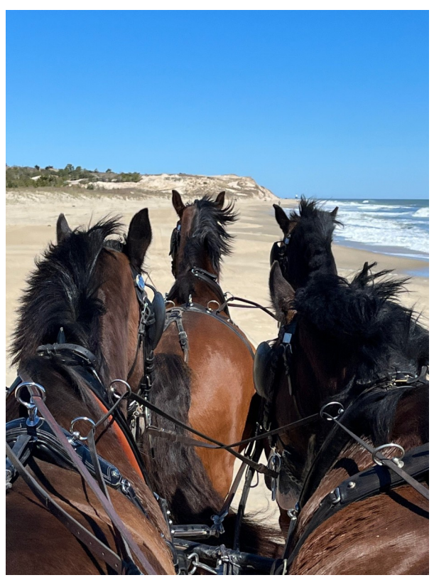
Frances Baker's 4-in-Hand Team on Cape Henlopen Beach