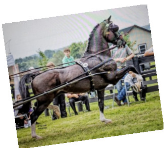
Waldemar the Stallion