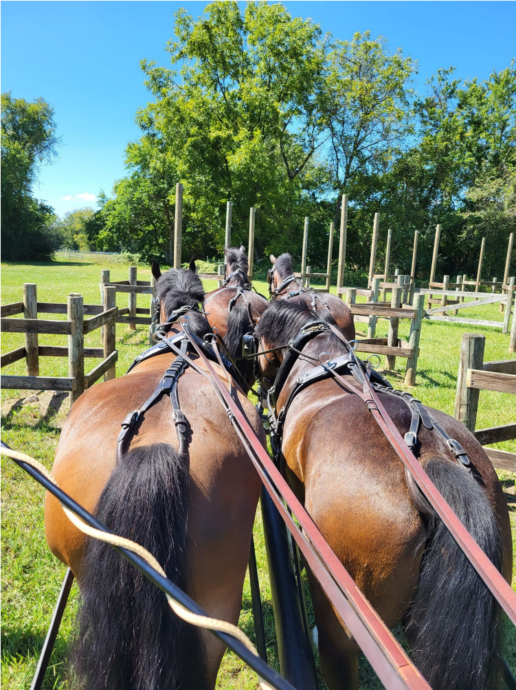
Frances Baker driving an obstacle at Fair Hill