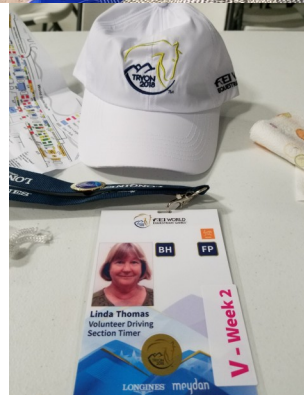
My Volunteer Credentials