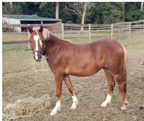
Tara Bruning's new Welsh