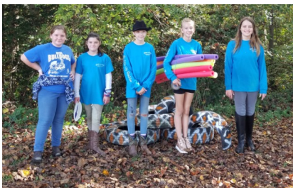
Volunteers from Saddle Up Stables