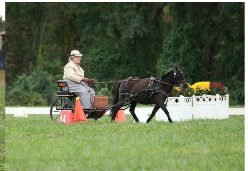
On the Cones portion of the event