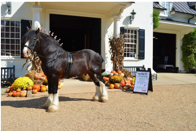
Aryshire Farm Shire Horse

Aryshire Farms is a unique farm located in Upperville, VA. Their mission is to bring livestock and crop production to both self-sufficiency and profitability. Among the animals residing at the farm are such rare breeds as: Shire horses, Scottish Highland cattle, Ancient White Park cattle, Gloucestershire Old Spot hogs, and several breeds of free-range chickens, turkeys, and ducks. Pheasants and wild turkeys are raised for release into the farm woodlands, areas which are being replanted and managed so as to provide "wildlife corridors" among the various habitat areas. Native trees, plants and grasses are being re-introduced as woodland cover, hedgerows, and fodder crops. Aryshire Farms Shires participate in Draft and Pleasure Driving Shows.