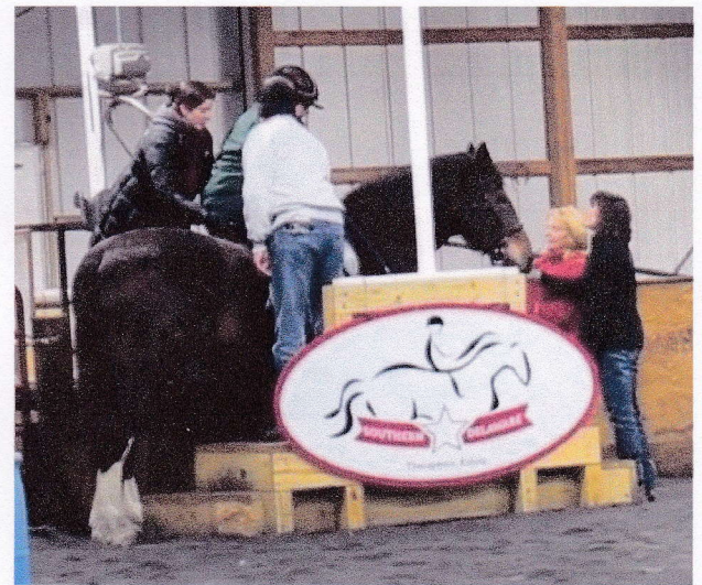
Above: Lee as a Therapy Horse at Southern Delaware Therapeutic Riding