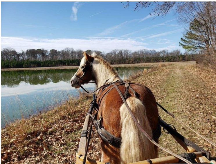
Smarty—Sherry Harris' Haflinger at Wye Island