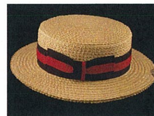
Classic boater hat