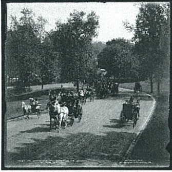
Nice Sunday drive sometime in 1905