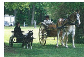
All sizes welcome at the DDC Pleasure Show Caroline 4-H Park, Denton, MD