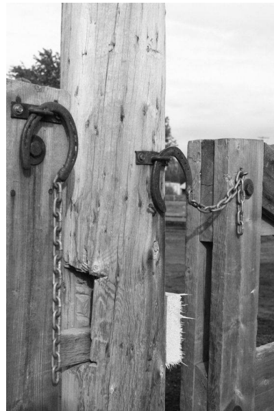
Repurpose your old horseshoes as Gate Latches