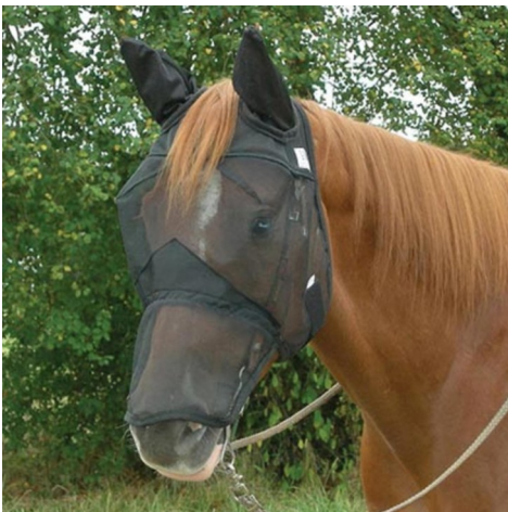
Cachel Fly Mask

For over 30 years I have been driving my equines year round. One of the biggest problems I have faced is keeping the hordes of bugs off. I use a combination of anti-fly products. One of my favorite items is called a string body cover— mine is an old leather one. It does keep most of the horse flies off the body. I get a little larger size so it covers the shoulder, to past the rump and a few inches over the tail. I fasten it to the front strap on the breast plate or collar. Near the withers and down the bottom of shoulder strap on both sides, I use short straps with keepers. I also use one in the center of the back and one in front of the crupper to keep it from sliding off. You will still have to chase away a few bugs with the whip. For the neck, I use a mesh neck cover. Velcro fastens under the neck and to the crown of bridle. I use a mesh, full ears and long nose head cover. (Cachel makes a nice sturdy one.) I buy one a size or so larger than my animals head so that it fits over the driving bridle and blinders. The mesh head and neck pieces keep off house and deer flies. IMPORTANT! BE sure to make sure the nose piece is short enough so that it does Not cover the nostrils (you may have to sew it)! Its hard to breathe through that stuff. I spray the legs with fly spray. We go out early and are usually out for 1-3 hours. It's worth the effort when the bugs are bad and the humidity is worse.