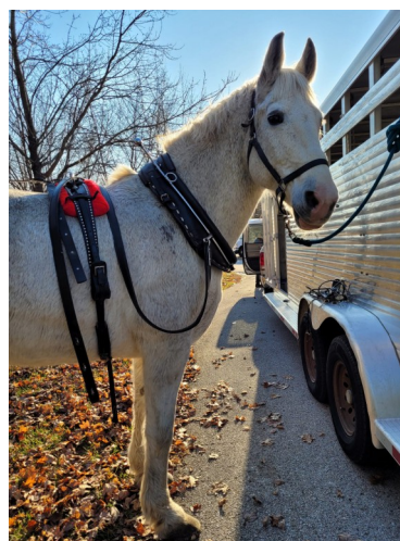
Howie getting ready to go to work