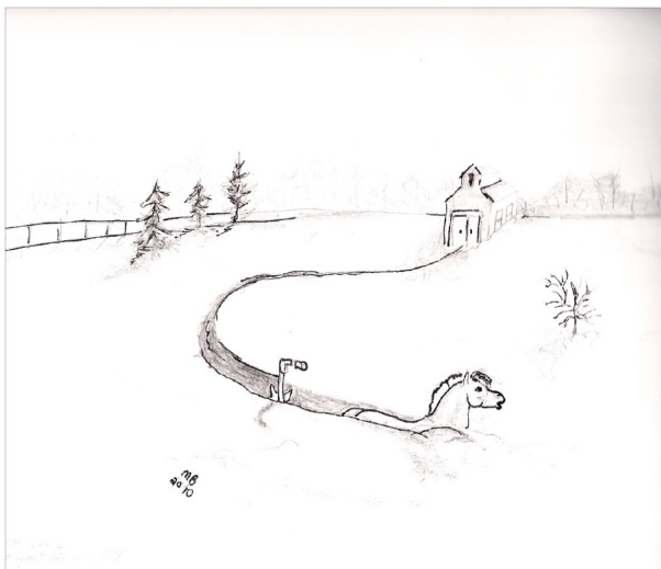
The sometimes skewed view of a paranoid pony

It's great, Willy—you KNOW spring is coming now that you can actually see over the snow! - submitted this month by Klever Kilar since Willy can't see to find his pencils.