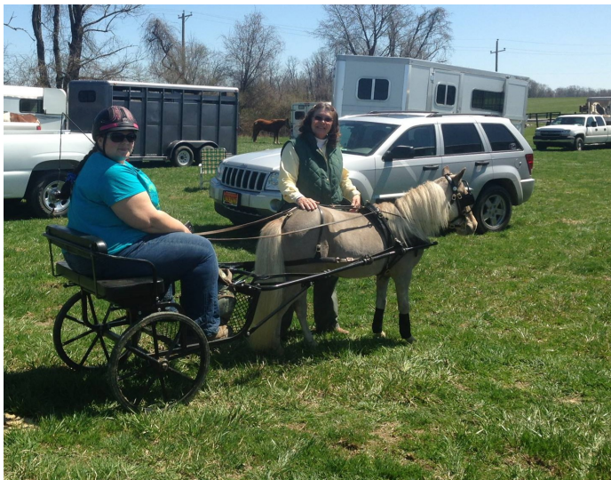
Prospective new Driver with DDC? Enjoying a beautiful day at Fairhill with her mini.