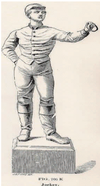
FIG. 705 K Jockey.

From the 301/50 Split, head N on SR 301 Blue Star Hwy. Left on SR 313 N. Galena Rd. Left on SR 213, proceed through the towns of Galena and Kennedyville, Right turn on 298. Continue onto 566. Rosedale Cannery Rd, 1.8 miles, cross over Royal Swan Rd and continue .9 miles on Eagles' Nest Road. Farm is on the right at 13931 Eagles Nest Farm Lane Still Pond, MD.