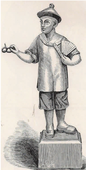
FIG. 704 K Chinese.

The two examples shown below are from the Illustrated Catalog and Price List from the V.W. Fiske Iron Works in New York from 1910. The cost of these human figures, at the time, painted in colors was $42.00! These posts, when placed in front of private homes, showed not only the taste but also the affluence of the particular home owner. On larger properties and estates, more simple examples would be installed in the rear of the home for trades people.