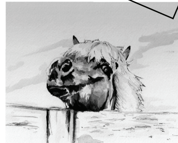
The sometimes skewed view of a paranoid pony