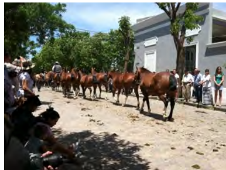
Troppilla of geldings following their lead 'bell' mare in a parade