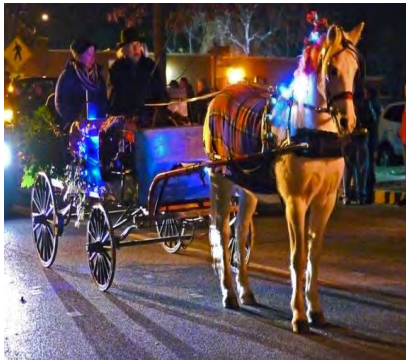
Easton MD Christmas Parade