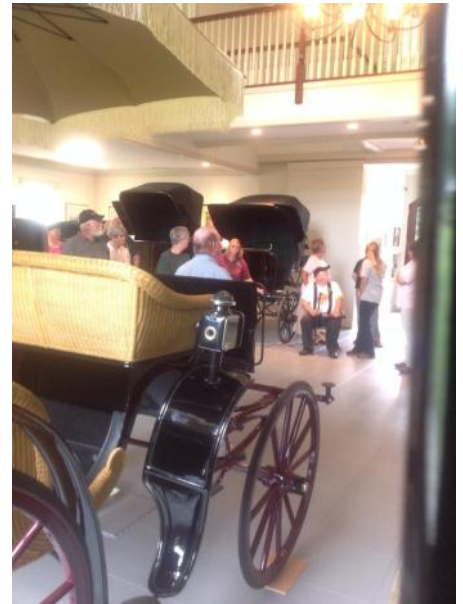
Right: Wicker antique with fringe parasol top