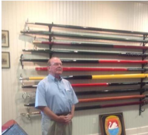
Top: Pole collection