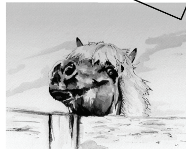
The sometimes skewed view of a paranoid pony