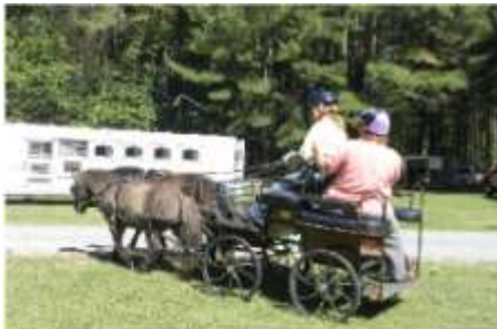
More photos from Blackbird Drive

Note: Classified items will run for two months unless requested otherwise. Please let us know if your article has sold or if you want to continue the ad after 2 months.