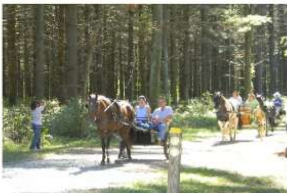
More photos from Blackbird State Forest Drive