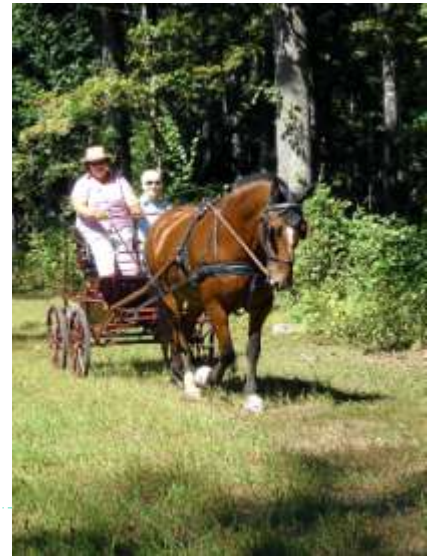
More photos from the Blackbird Forest Drive