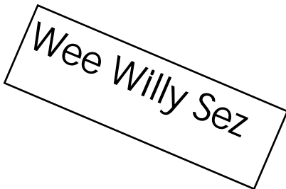
The sometimes skewed view of a paranoid pony

Note: Classified items will run for two months unless requested otherwise. Please let us know if your article has sold or if you want to continue the ad after 2 months.