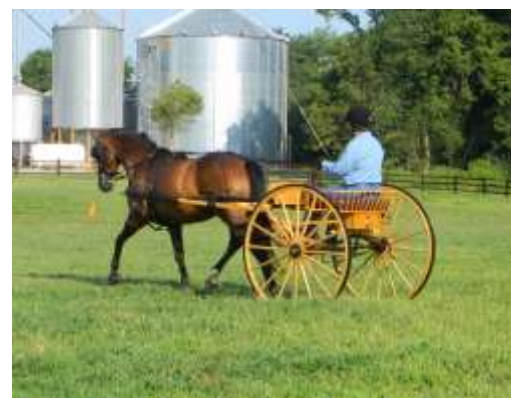
Photos from ADS Testing at Hollyville Farm