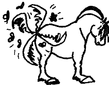
Horse and Buggies